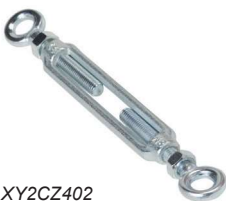
XY2CZ402 XY2CZ403 XY2CZ404

(1) An adjustment shim XY2CZ713 and 2 end springs XY2CZ712 are supplied with XY2CED switches.