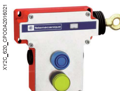
Emergency stop rope pull switch with window for viewing the cable tension